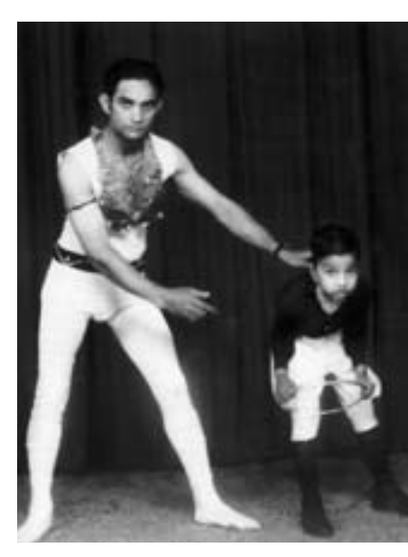
By Gopal Singh Chandan. Nairobi. © 1932