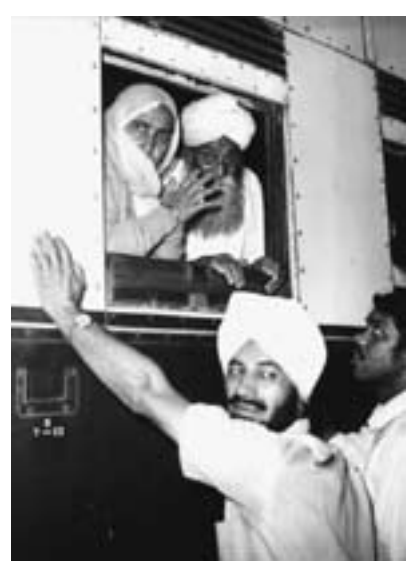
By Mohammad Amin. Nairobi.1965.